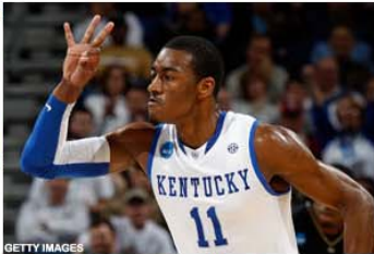
Wall Reportedly Generating Interest From Multiple Shoe Companies